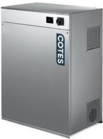
C35 DEHUMIDIFIER (model shown with PLC)