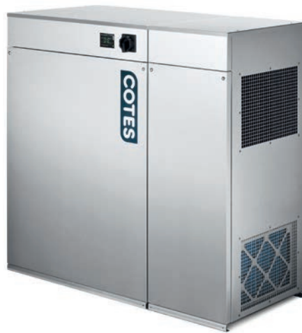
C35 DEHUMIDIFIER WITH HEAT RECOVERY MODULE